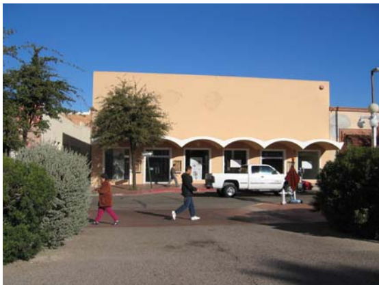
Visit City High School at our new location – 48 Pennington Street in downtown Tucson.

at Tucson-Pima Public Library 101 North Stone Avenue parking available in garage below library, enter from Alameda