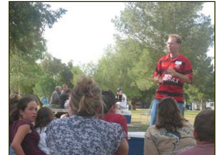
City High School's first annual Picnic in the Park took place Sunday, May 16 at La Madera Park in central Tucson. Students, families, and friends spent an afternoon of meeting, eating, playing, and learning. Look out for announcements for upcoming events for City High School students to participate in this summer.